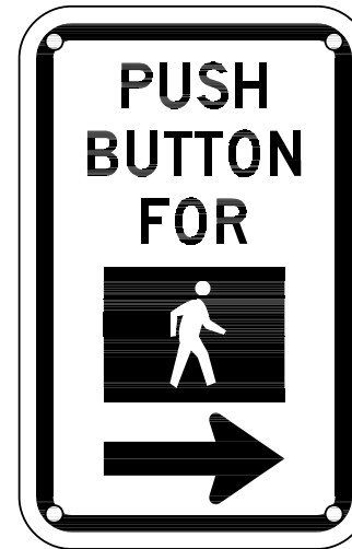
STANDARD OPTION A